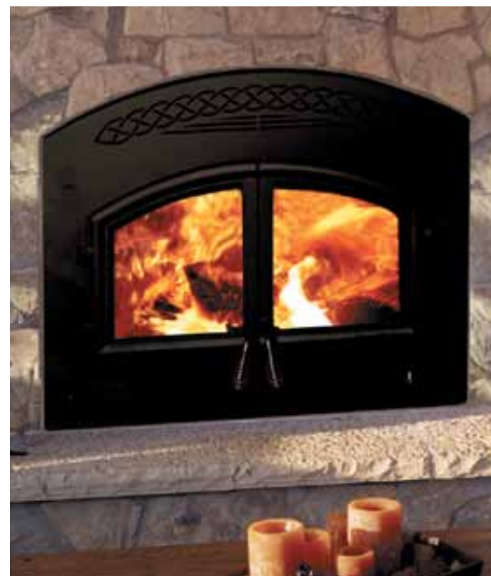
Above & Cover: Constitution shown standard.